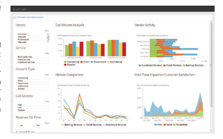
Figure 3: Call Center Operations Analysis

OpenText™ Analytics and Reporting products meet these design principles. OpenText provides a powerful analytics development environment and an enterprise-scale analytics deployment platform that can integrate many data sources; present data in familiar, web-centric formats; and embed analytic content in modular, maintainable apps. OpenText™ Information Hub (iHub) can support millions of users, provide instant interactivity with data, and operate in multi-tenant environments. It simplifies delivery of in-context insight, provides intelligence for thousands of apps, and enables delivery of data and insights to virtually any channel.