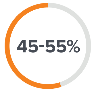
The average IT organization spends 45 – 55% of its time on unplanned and urgent activities.

The average IT organization spends 45% to 55% of its time on unplanned (and urgent) activities. 4 Non-project work like ad hoc requests, maintenance, and fixes can distract resources and derail project plans in a hurry. Without visibility across the entire lifecycle of work, it’s nearly impossible to assess the real impact of these requests. Until you take a broader view of enterprise work, you put every project at risk of failure.