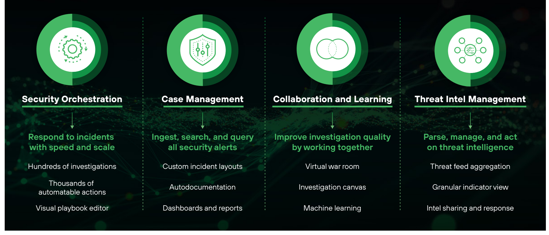
Figure 3: The pillars of a SOAR platform