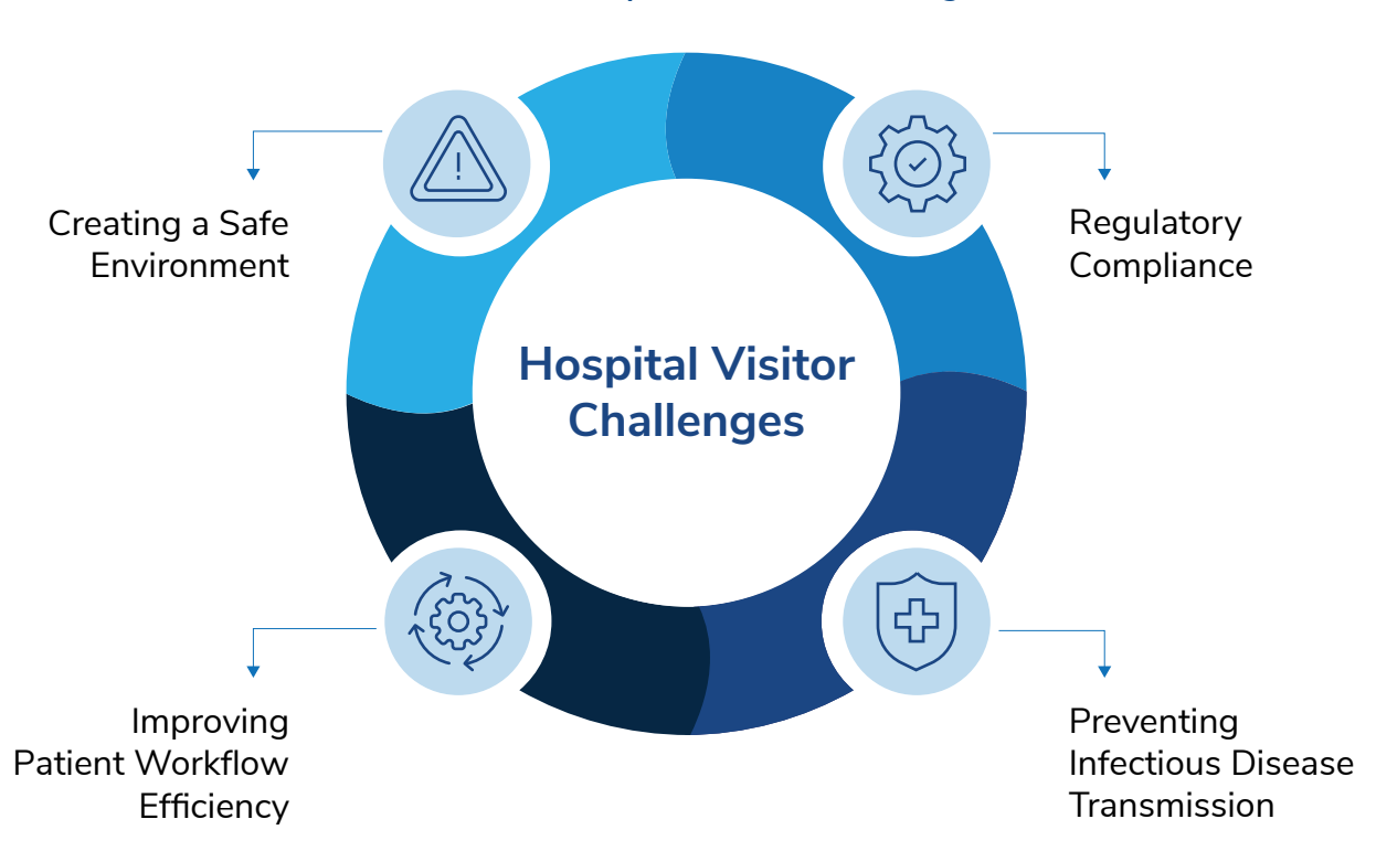
EXHIBIT 1: Hospital Visitor Challenges