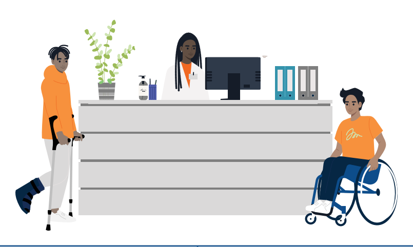
EXHIBIT 2: Intelligent Patient Visitor System Attributes

Solid, well-executed security procedures support positive experiences for both patients and visitors alike. They provide value and peace of mind that builds trust between the hospital and community it serves. Hospitals should prioritize securing the funding needed to digitally transform their security and visitor control efforts when choosing a visitor management solution.