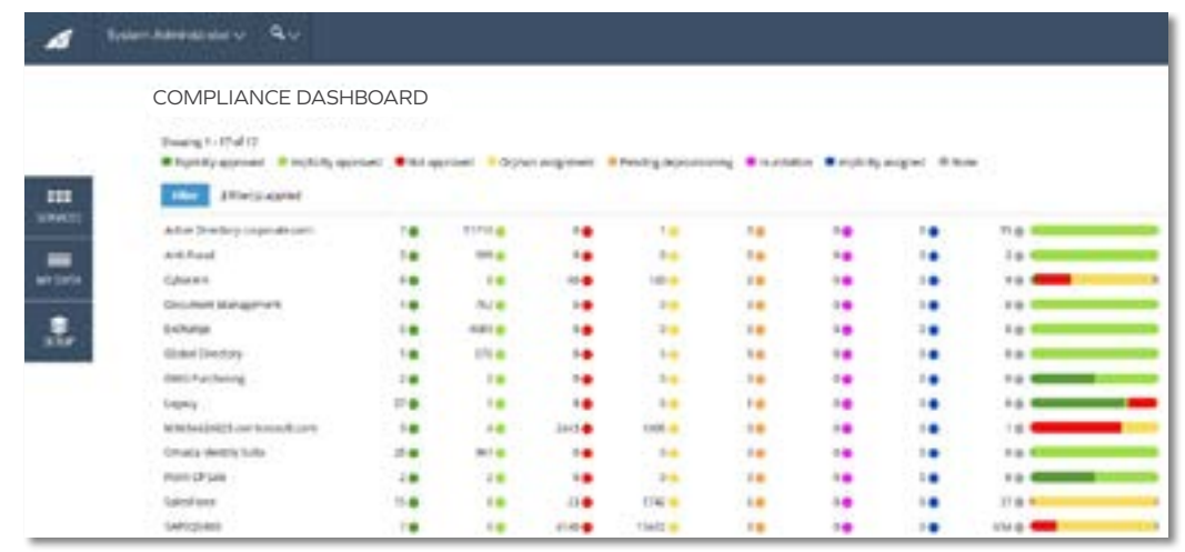
A Compliance Dashboard provides a valuable cross system overview providing the compliance status for all governed systems and applications.