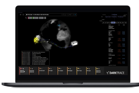
Figure 7: Sample UI shot shows a device infected with ransomware identified by Cyber AI.

With Cyber Al's ability to connect patterns from across diverse infrastructure, the industrial system was defended from this machine-speed attack.