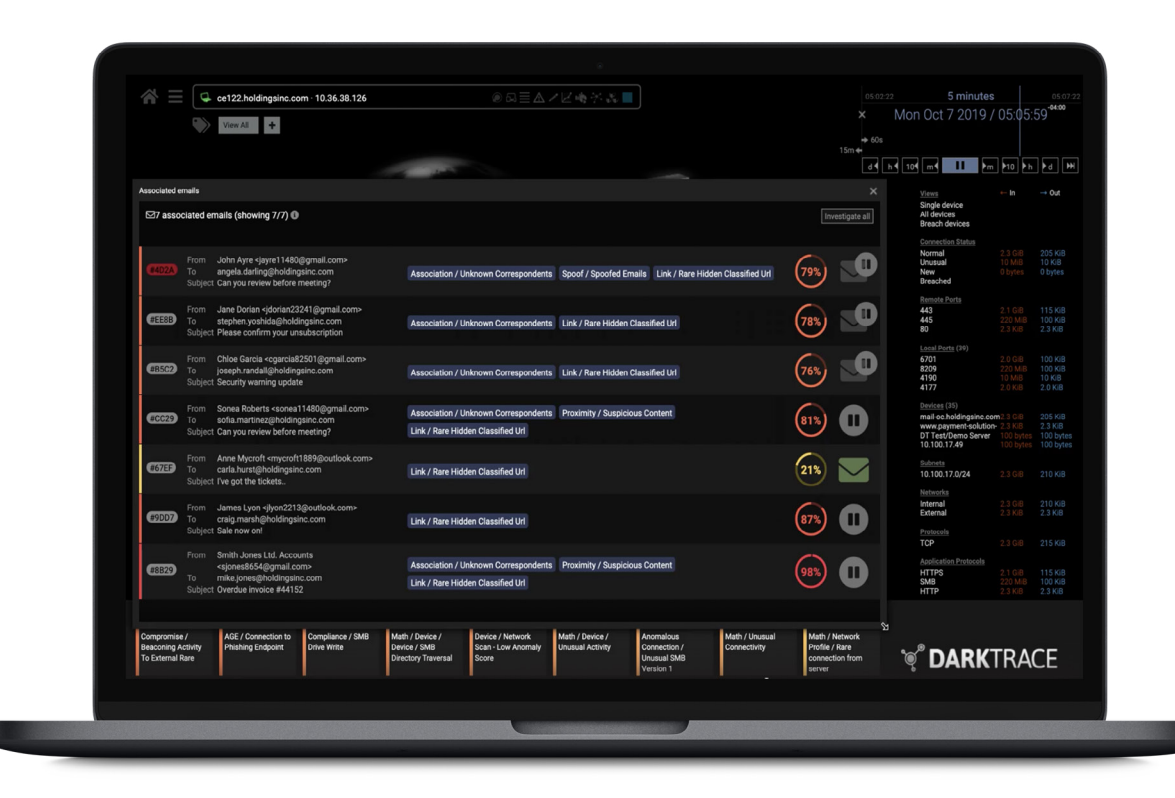
Figure 3: Antigena Email detects a series of emails associated with a ransomware campaign