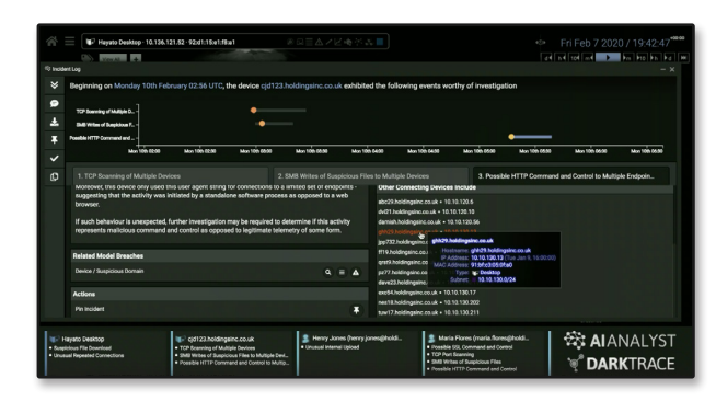
Figure 5: Sample UI shot shows Cyber AI reporting on similar anomalous SMB activities.

While the security team had left the office for the weekend, Antigena Network was able to independently stop the attack, interrupting all attempts to write encrypted files to network shares.