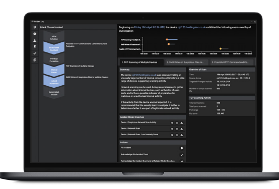
Figure 6: Sample UI shot shows Cyber AI Analyst reporting on a ransomware attack.

Although the team neglected to action Darktrace alerts earlier, Cyber Al was still able to recognize every step of this advanced attack, allowing the team to effectively respond and prevent further damage.