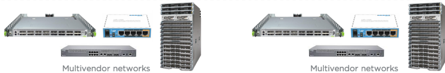
FRINX UniConfig Architecture